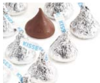
16005 Hershey's Kisses® Chocolate