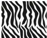
54358 Tissue Sheets— Zebra