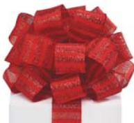
9718045 #9 Ribbon— Red Metallic Stripe