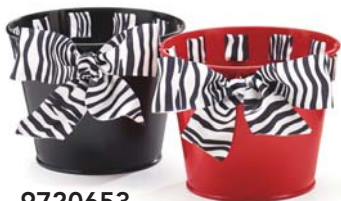
9720653 Pot Cover Asst.